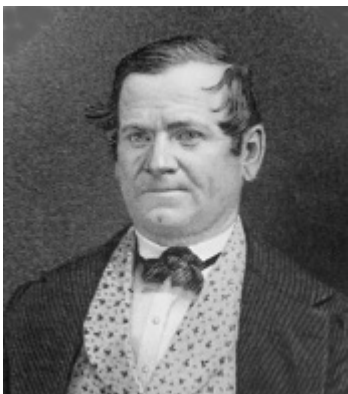
of the Twelve Apostles.

The Great Western Reserve comprised land granted by King Charles II in 1662 to the colony of Connecticut. The grant extended Connecticut's western border throughout the then-unknown continent, stretching three thousand miles to the Pacific Ocean. During the following century, parts of this strip were ceded away, but until 1800 the state of